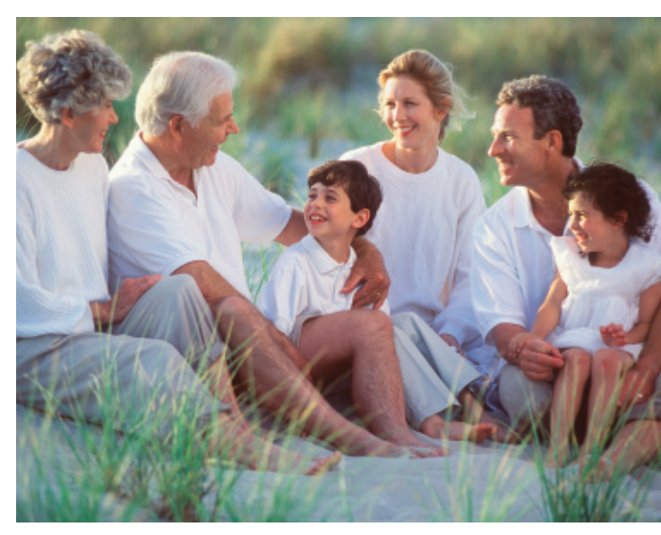
we grow with you.