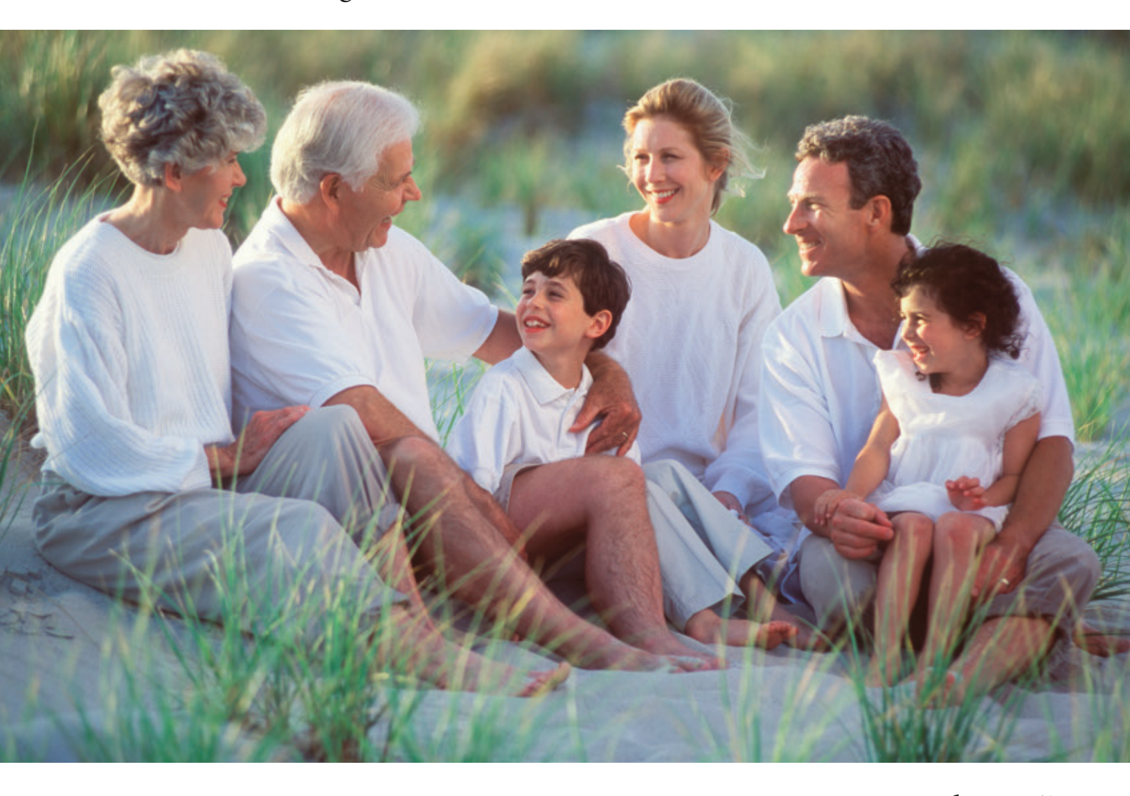
we grow with you.